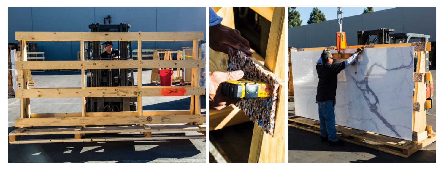
• Use 3 straps to tie the panels to the A-frame, and wrap plastic around the entire A-frame 3X to prepare the package for shipment.